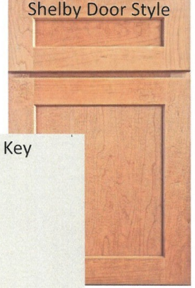
Siesta Key Sand