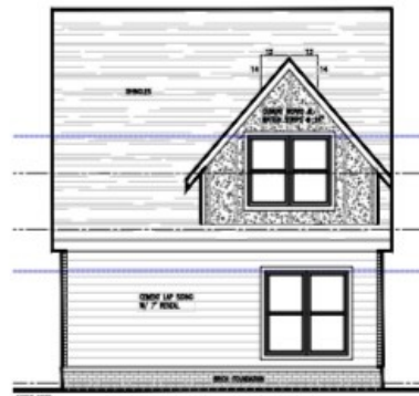
REAR ELEVATION 1/4"

NOTE: HOUSE IS 1 1/2 STORIES. DORMERS = 50% OF ENTIRE ROOF WALL PLATE HEIGHT = 4 FEET ON BOTH FRONT AND REAR. WALLS ARE 4 FEET HIGH ABOVE WALL PLATES GFA ON 2ND FLOOR = 75% OF 1ST FLOOR.