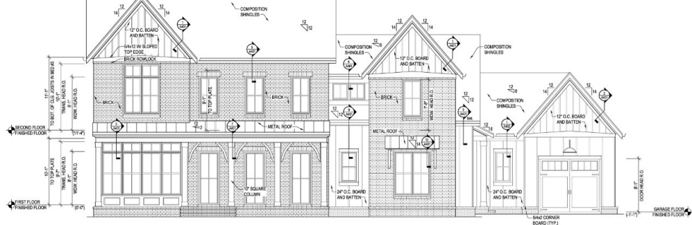
FRONT ELEVATION SCALE: 1/8" = 1'-0"